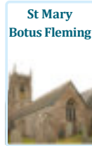
St Mary Botus Fleming