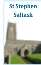
St Stephen Saltash