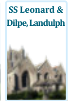
SS Leonard & Dilpe, Landulph

Love God, Serve People, Make Disciples. www.saltashteamministry.org