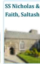
SS Nicholas & Faith, Saltash