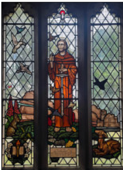
St Francis in stained glass window in St Erney Church