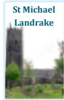
St Michael Landrake