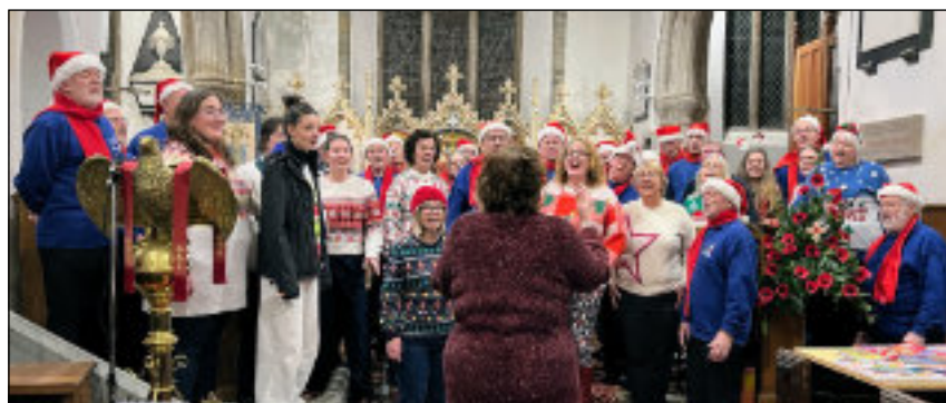
Choirs at Christmas Sing-along at St Stephen's