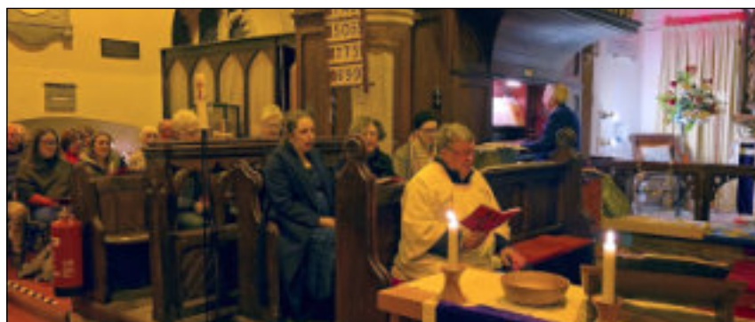
Nine Lessons & Carols at St Mary's