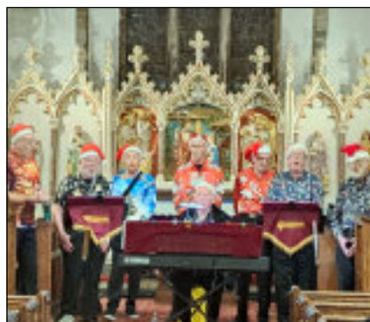
Burraton Boys at St Stephen's