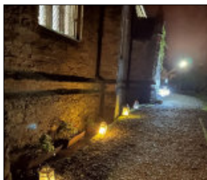
Lanterns lighting the way to St Michael's