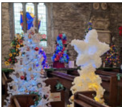
Christmas Tree Festival at SSNF