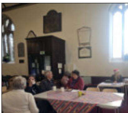
Christmas Cuppa at St Stephen's