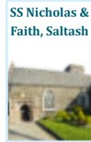
SS Nicholas & Faith, Saltash