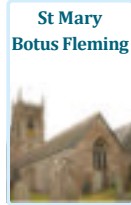
St Mary Botus Fleming