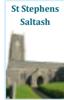
St Stephens Saltash