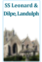
SS Leonard & Dilpe, Landulph

Love God, Serve People, Make Disciples. www.saltashteamministry.org