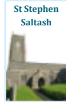
St Stephen Saltash