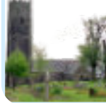
St Michael Landrake