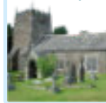
St Terninus St Erney