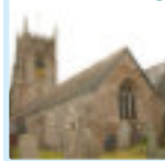
St Mary Botus Fleming