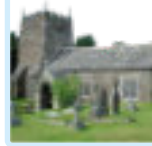
St Terninus St Erney