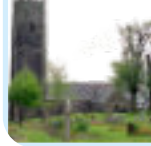
St Michael Landrake